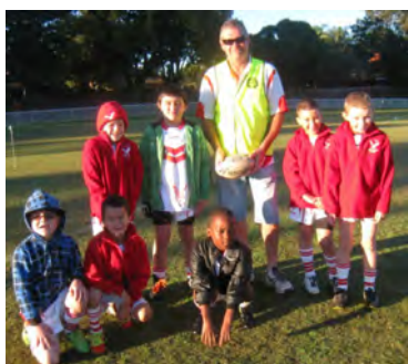
A little chilly at Airey Park last Sunday.

Our mighty U8 reds were champions today against the Strathfield Raiders in what was a very even contest (despite the for and against).